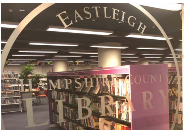
You can visit the library