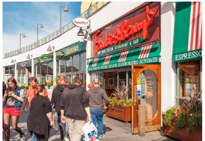
Frankie and Benny's - Restaurant and Bar