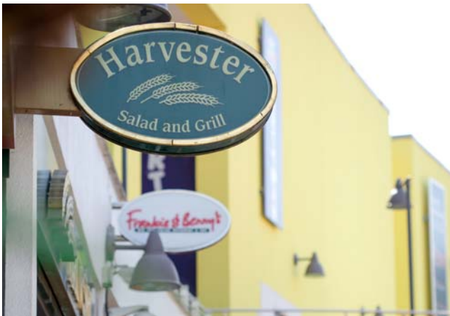
Harvester - Salad and Grill