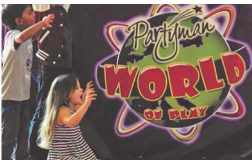
Partyman World of Play