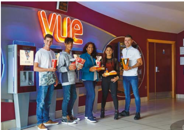
You can watch a movie