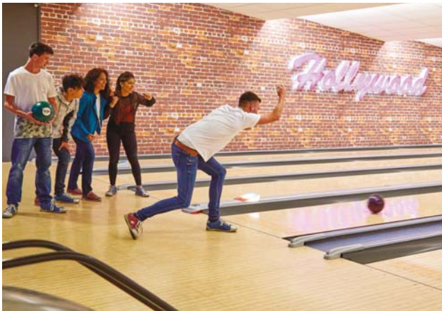
You can go bowling