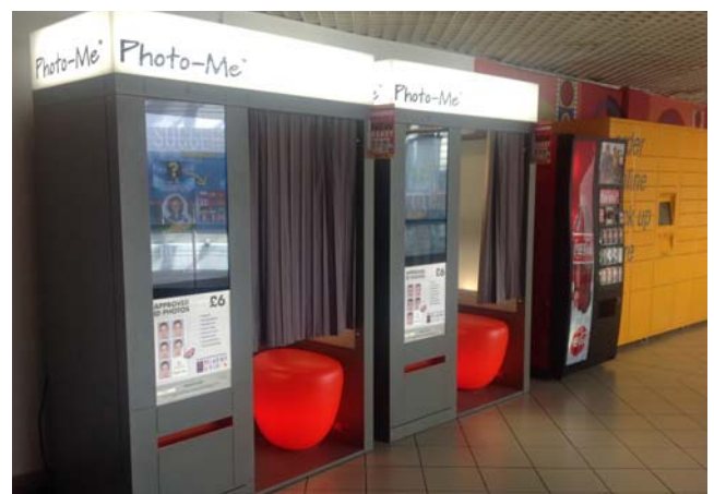
You can have your photo taken