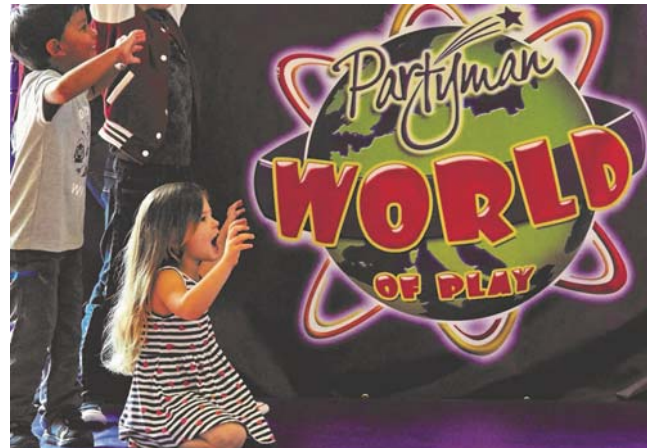
Kids can play at Partyman World