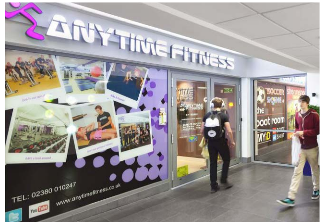
You can join the gym