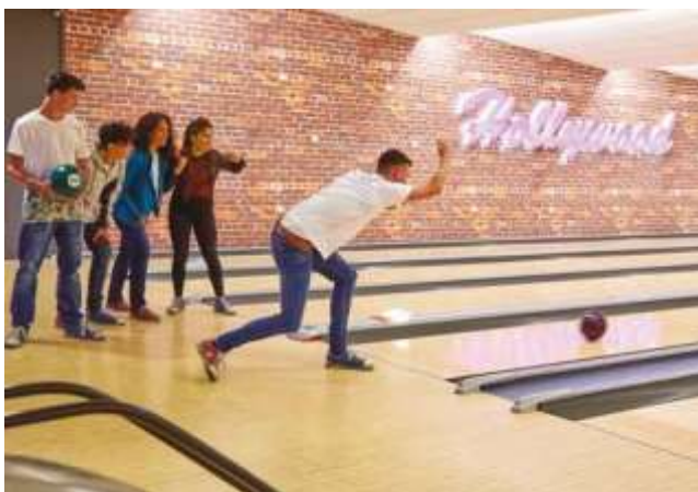
You can go bowling