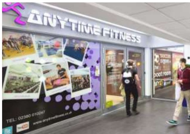
You can join the gym