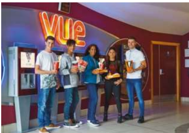
You can watch a movie