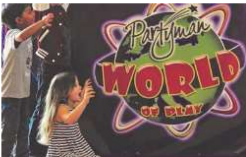
Partyman World of Play