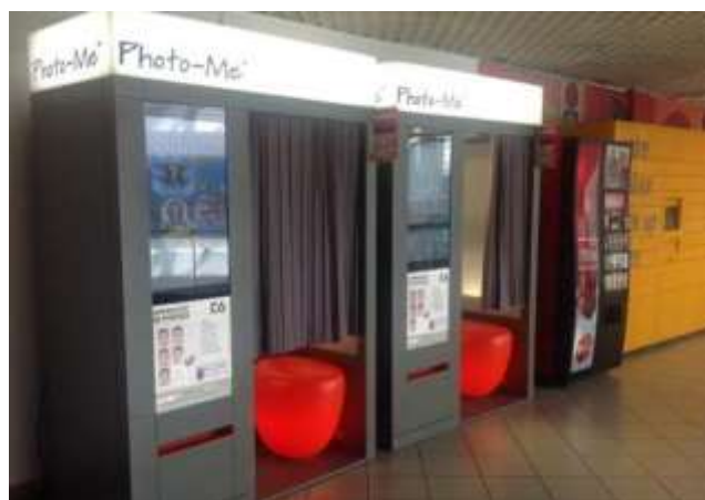
You can have your photo taken