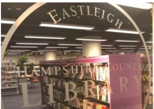
You can visit the library