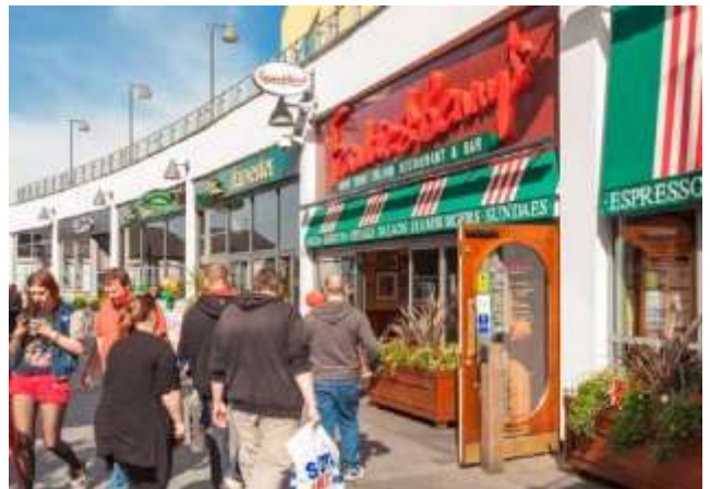
Frankie and Benny's - Restaurant and Bar