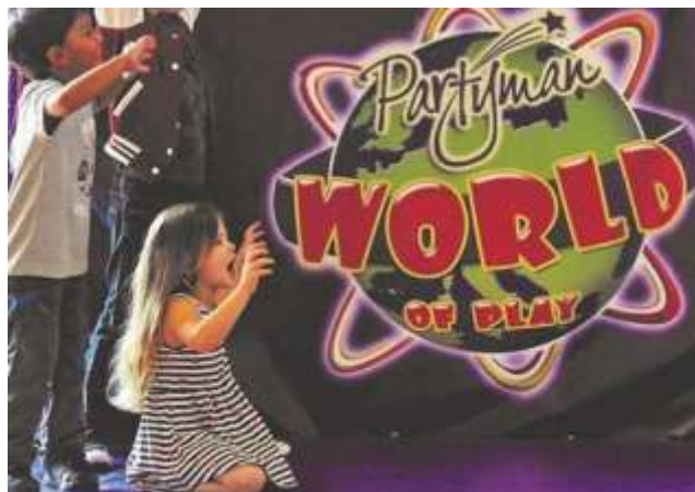
Kids can play at Partyman World